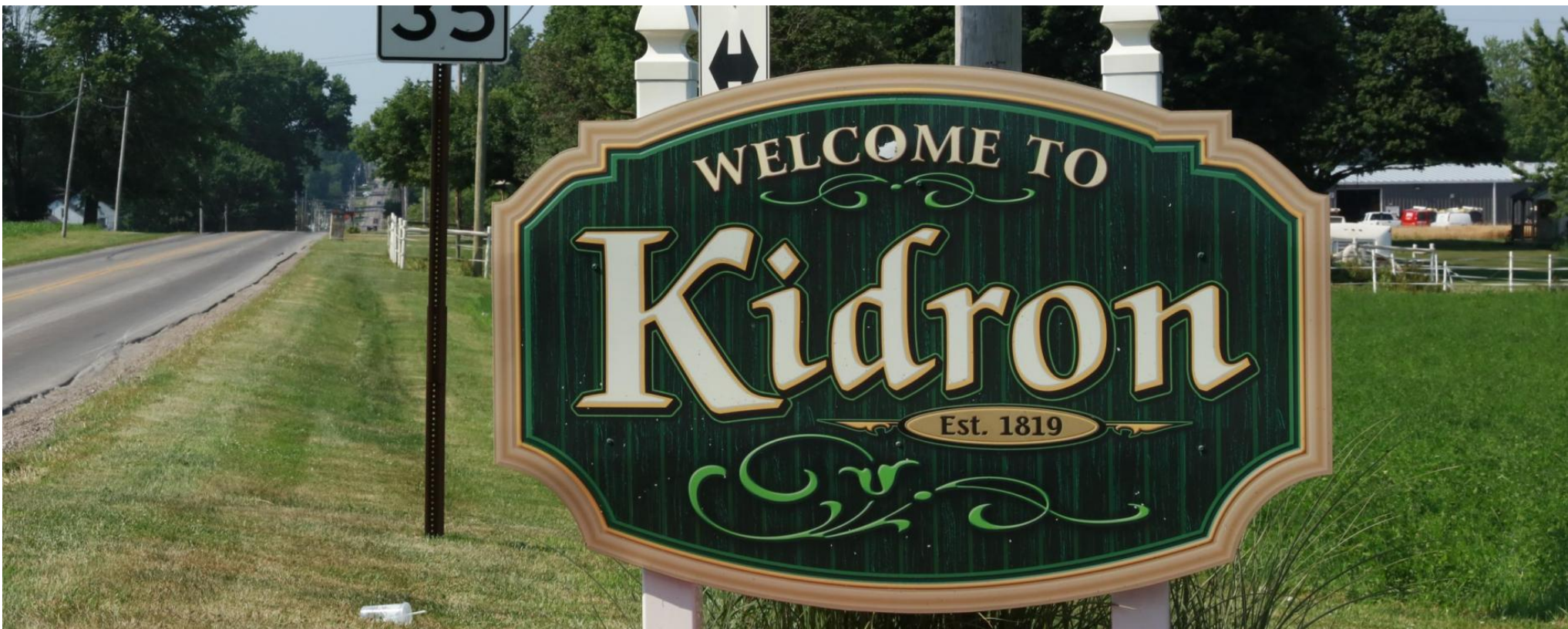
Edit Slide (/node/35/edit?destination=ahit)

Edit Welcome Text/Image (/node/21/edit?destination=ahit)